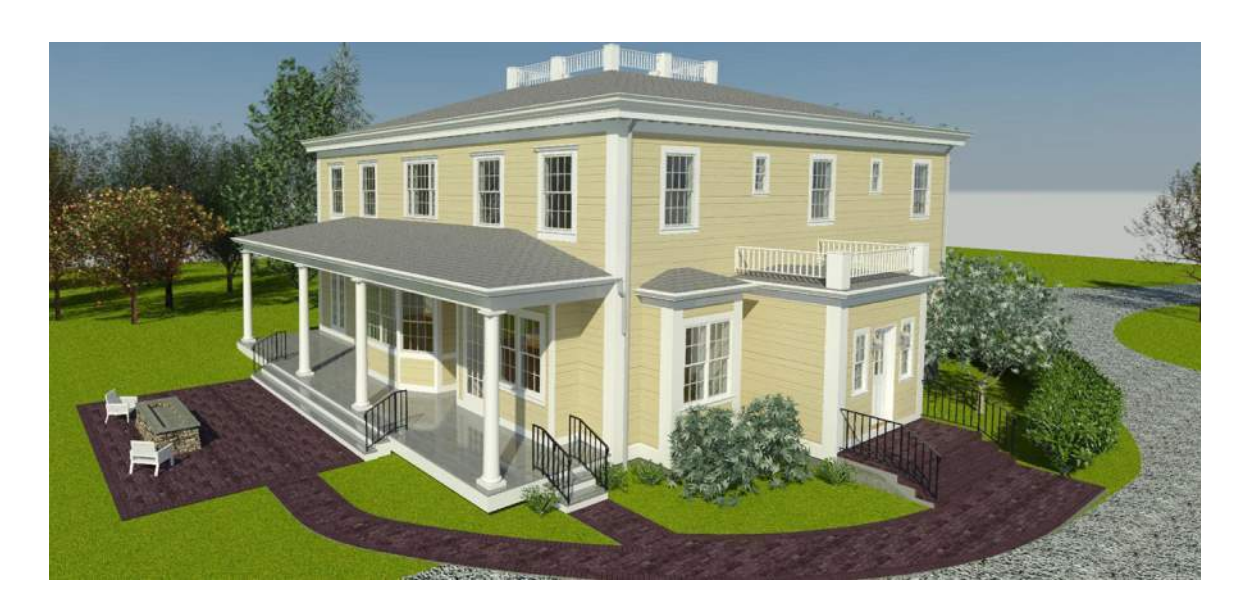
ATTACHED PATIO; DRIVEWAY ACCESS