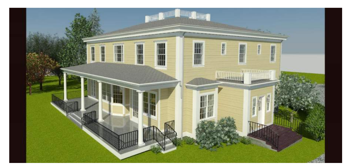
EXTENDED DECK, CENTRAL STEP AND GUARD RAIL