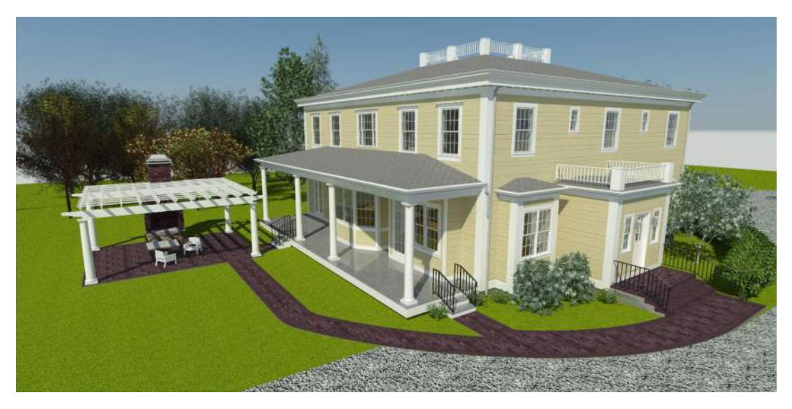
TRELLISED PATIO AT SIDE OF DECK