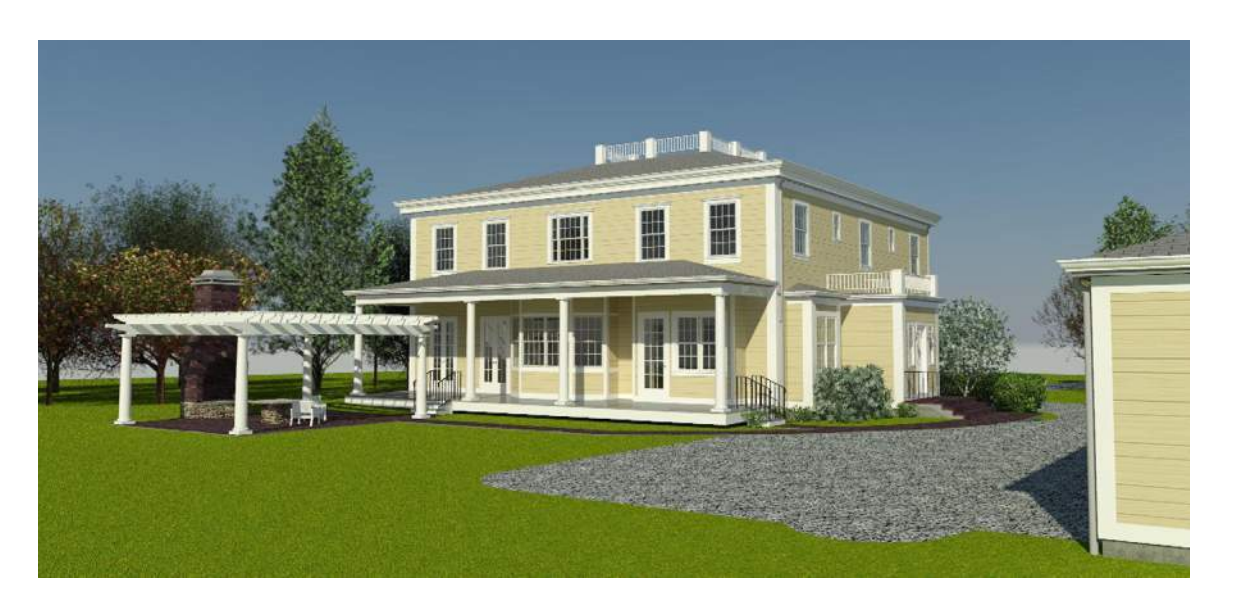
TRELLISED PATIO; LOW PERSPECTIVE