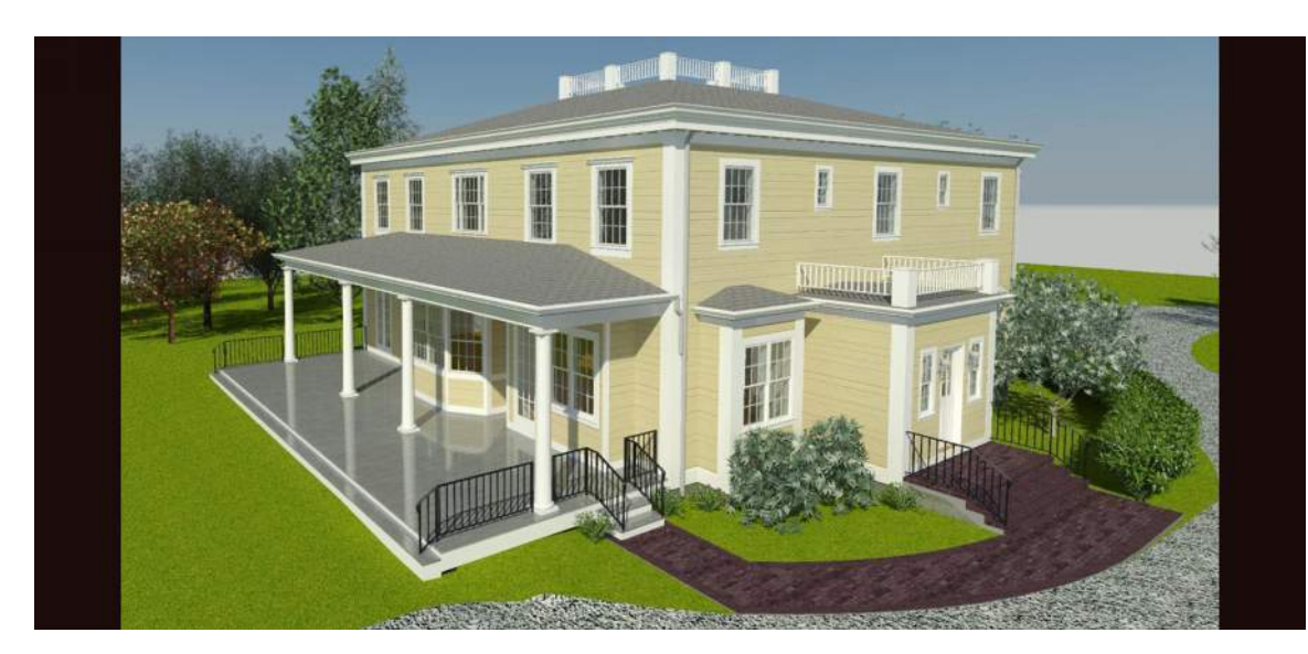
EXTENDED DECK, FULL WIDTH STEP, DRIVEWAY ACCESS