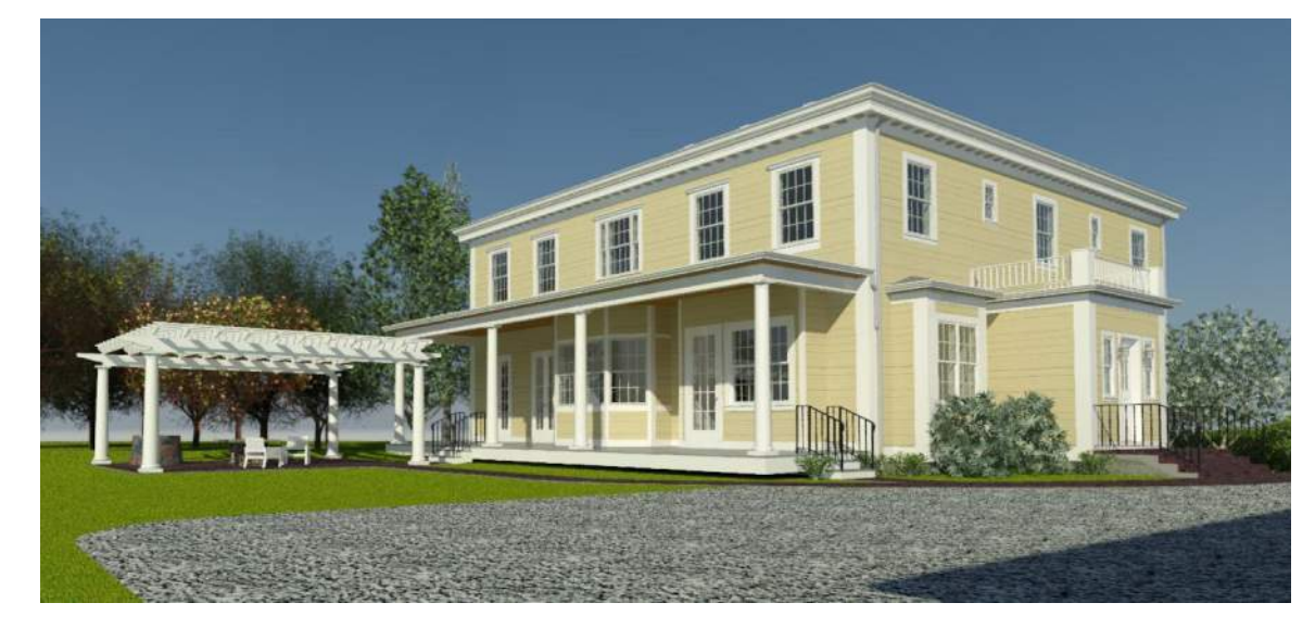
TRELLISED PATIO, NO FIREPLACE; EYE LEVEL PERSPECTIVE