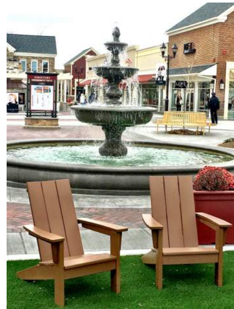
SITE FOUNTAIN REQUIRES A PUMP ROOM AND ROUTING OF UTILITIES