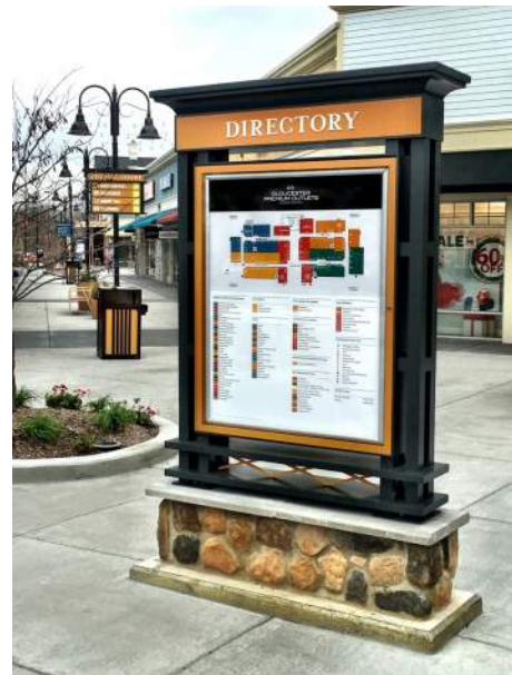
SITE IDENTITY ELEMENTS GUIDE AND LOCATE USERS