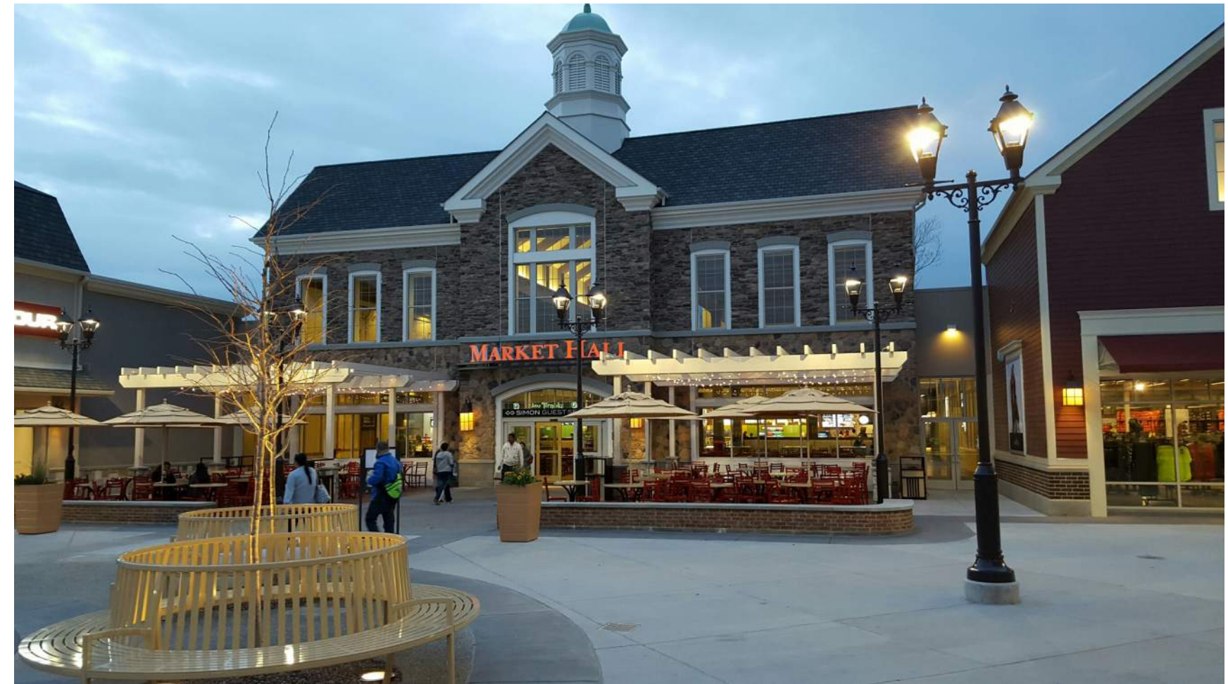
FOOD COURT, COMPLETED SITE PHOTO