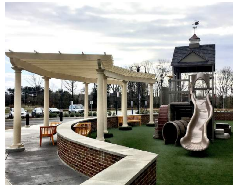
COORDINATION OF PRE-FAB ITEMS WITH SITE FABRICATED ELEMENTS AND MATERIALS