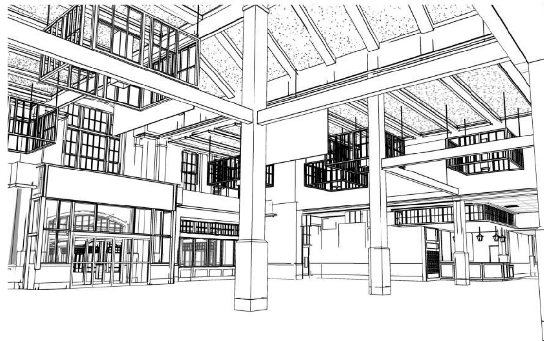
FOOD COURT INTERIOR, CONSTRUCTION DOCUMENT MODEL