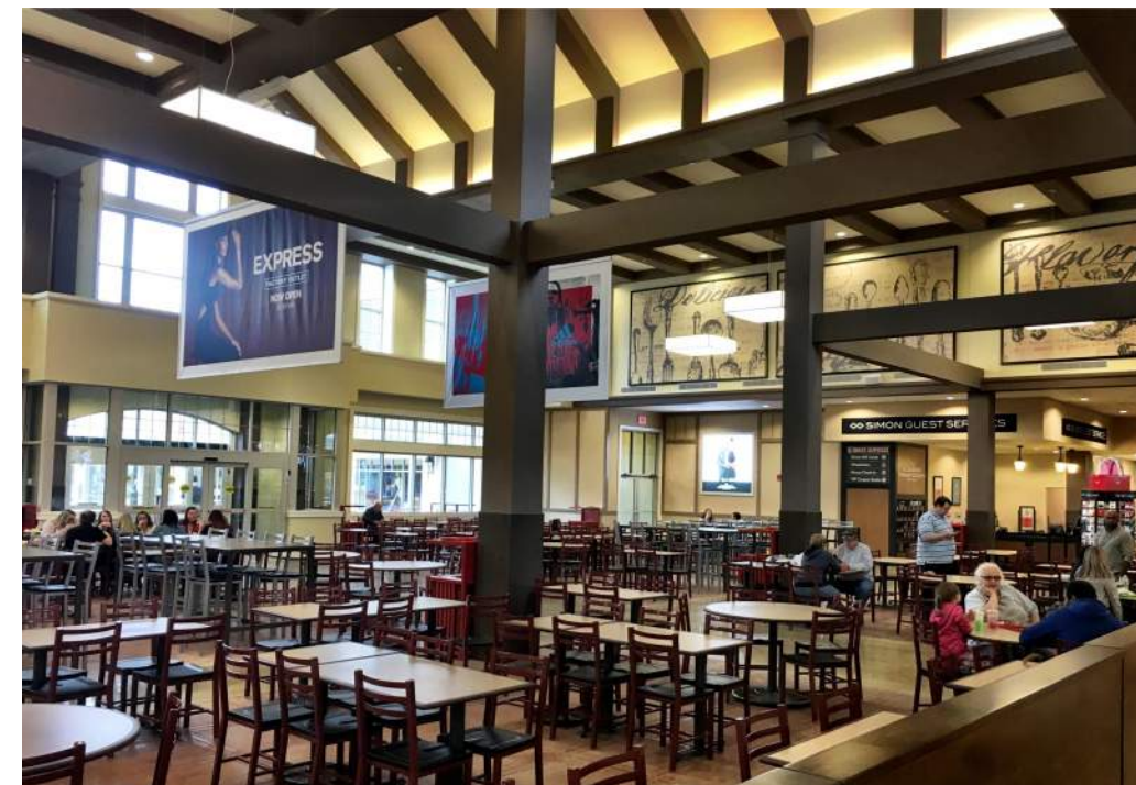
FOOD COURT INTERIOR, COMPLETED SITE PHOTO

Premium Outlets, Gloucester NJ Sketches and Photographs