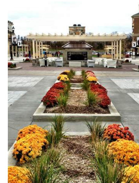
OVERSIZED FIREPLACE COORDINATION OF PROGRAM ELEMENTS WITH SAFETY REQUIREMENTS, FABRICATOR LIMITATIONS, AND MULTIPLE TRADES

Premium Outlets, Gloucester, is a $65M project that focused on exterior features and placemaking. Documentation heavily relied on coordination of pre-fabricated elements with landscaping, civil engineering, and material requirements. A minimalist approach with the bid set, to expedite the construction schedule, depended on extensive addendums, bulletins, field sketches and CA support throughout construction.