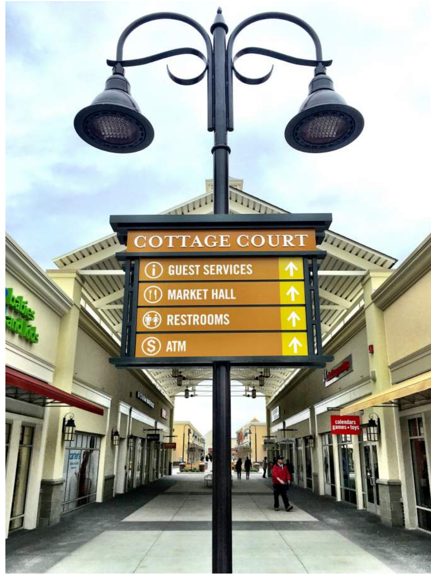
GALLERIA, COMPLETED SITE PHOTO