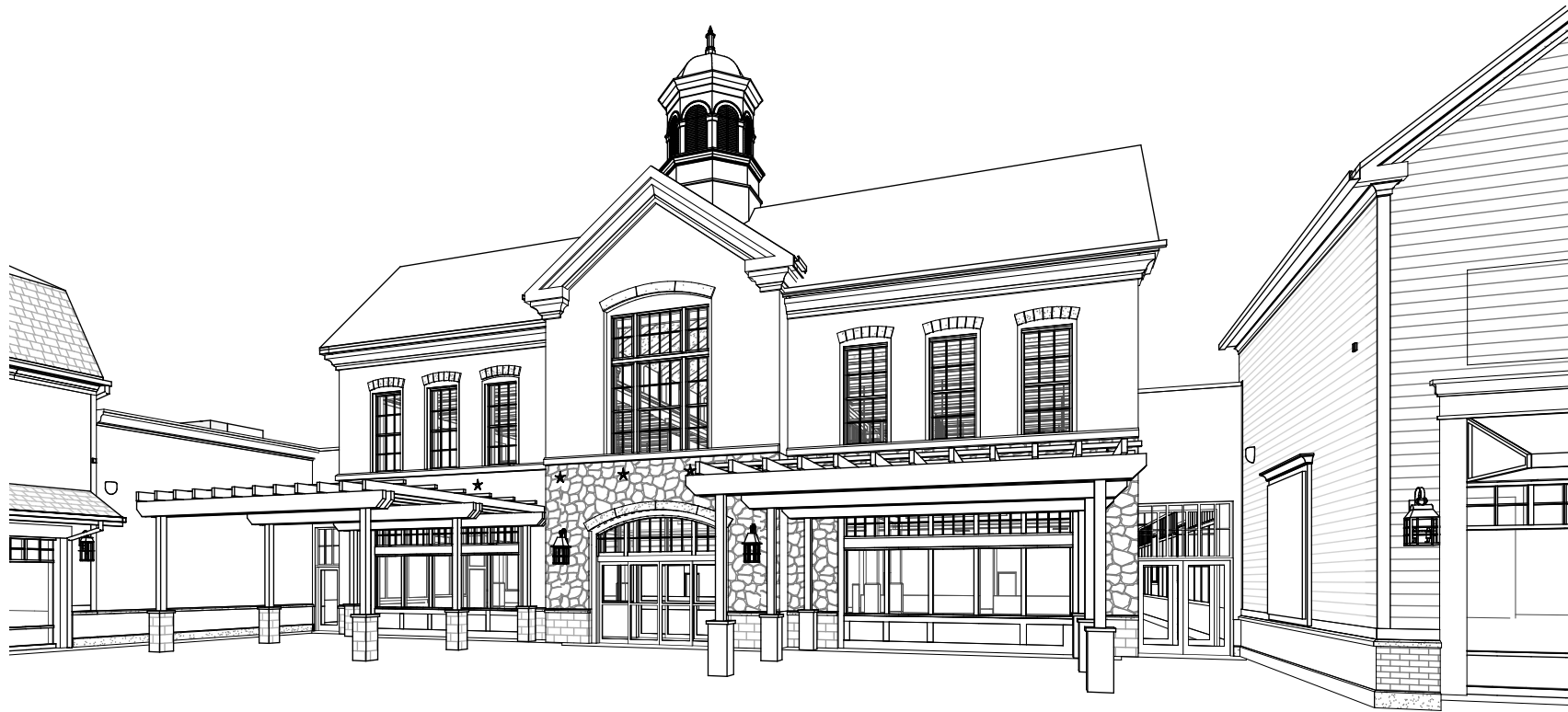
FOOD COURT, CONSTRUCTION DOCUMENT MODEL