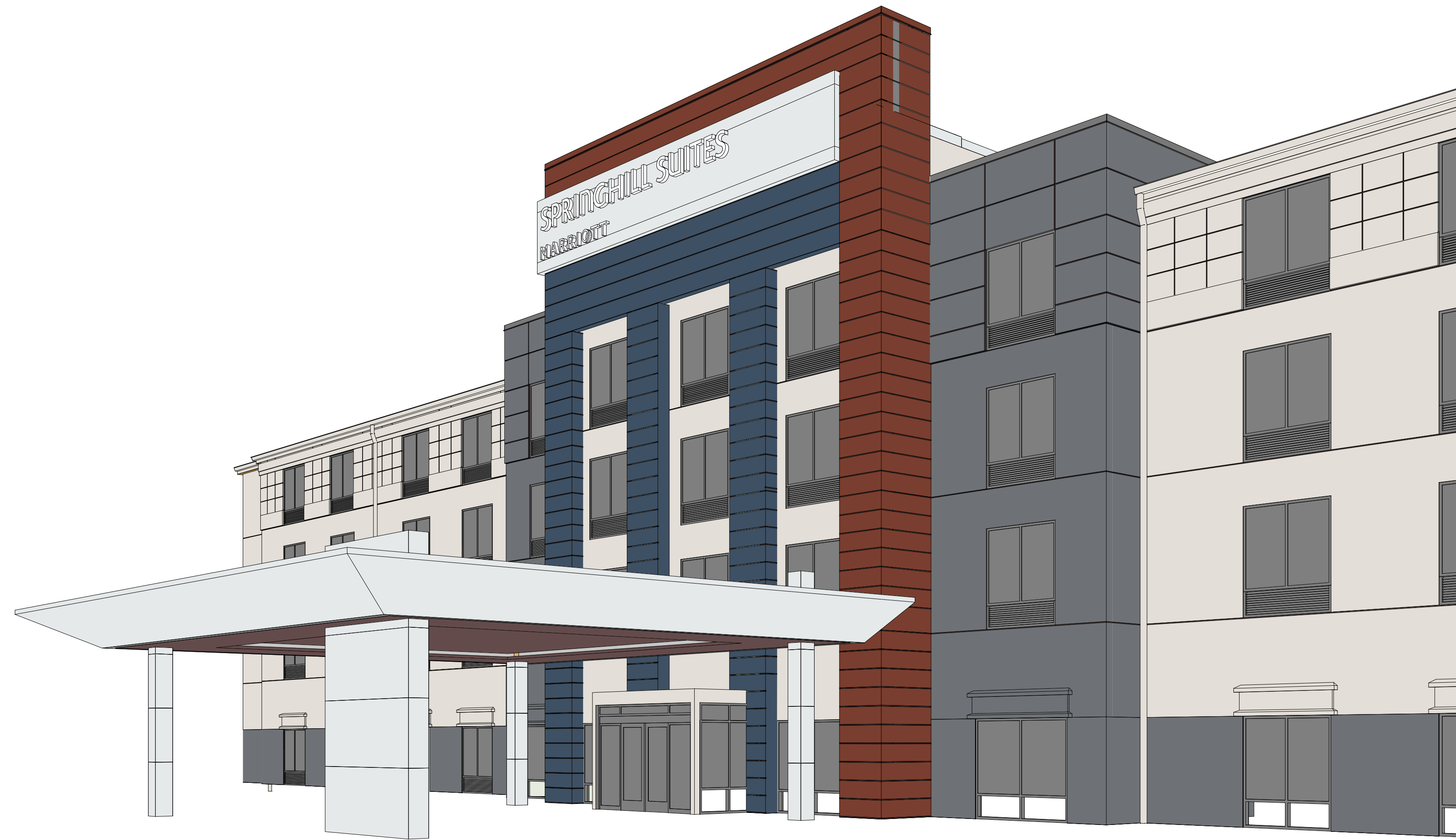
2 Entry Perspective 2