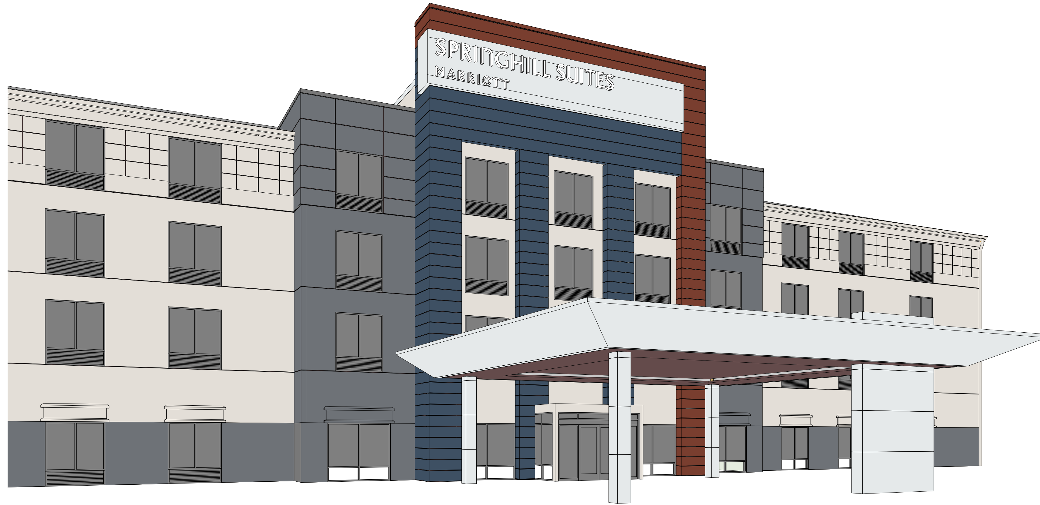
1 Entry Perspective